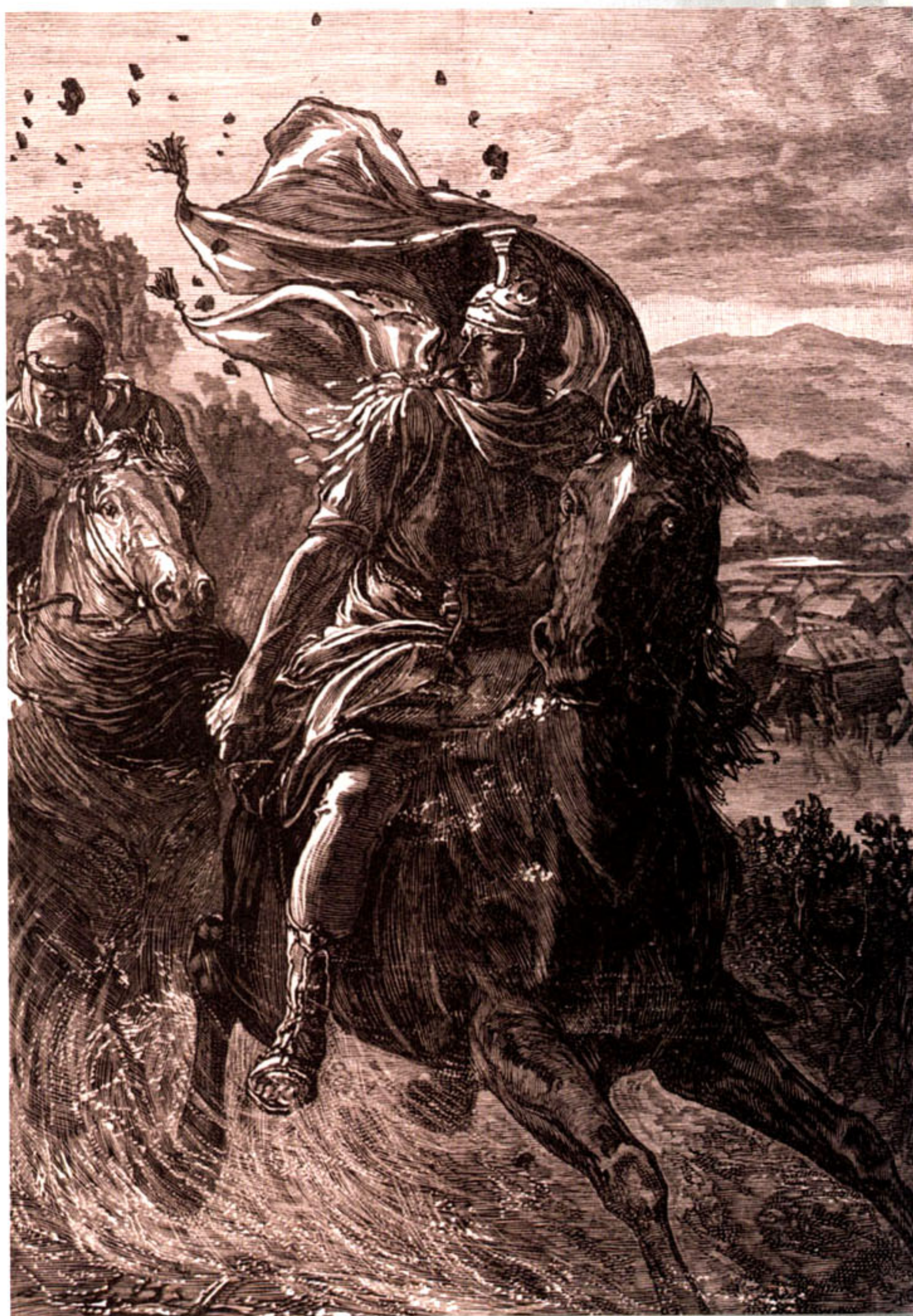
No escape: Pompey, shown here fleeing Rome before Caesar's arrival, wanted to avoid bloodshed in the capital city. After nearly defeating Caesar at Dyrrachium, his army was overwhelmed at Pharsalus.

had seen during the wars between Marius and Sulla, or perhaps Caesar's swiftness and resolution dismayed him, but Pompey the invincible found himself needing to regroup to prepare to meet Caesar's challenge. Caesar may have sought reconciliation with his rival, but the mask was now off, and Pompey wasn't having any. Their forces collided first at Dyrrachium in Greece, where Pompey's experience and