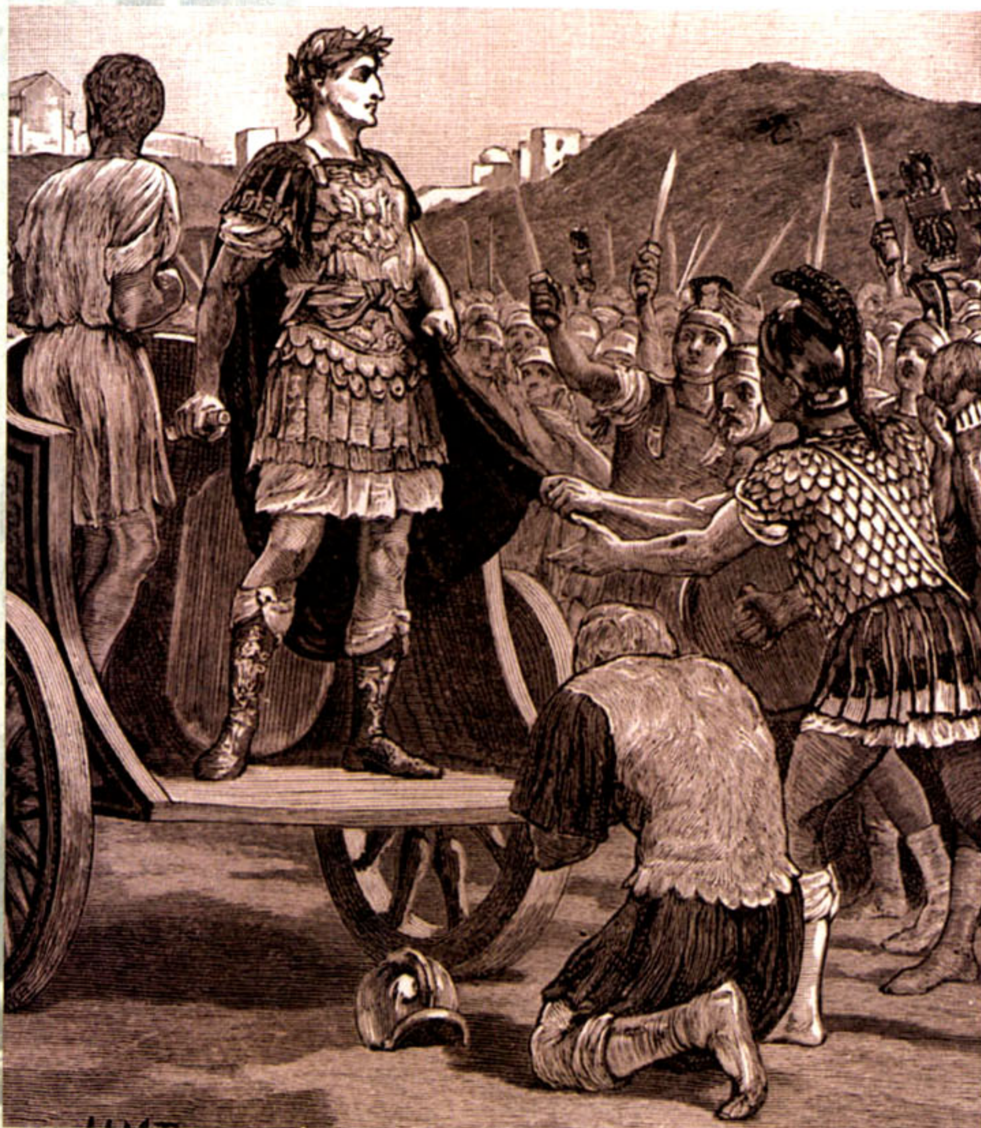
Adoring fans: Julius Caesar basking in the admiration of his soldiers. Caesar's rise to power owed much to the fierce loyalty of the fighting men who served under him.

This was the personality of the man who dominated his age like no other before or since, saving only One who came into the world a few decades later to preach the coming of a very different kind of kingdom from that espoused by Caesar and his confederates, and who had nothing in common with Julius Caesar except his initials. Gaius Julius Caesar — military genius, charismatic leader of men, author, demagogue, consummate politician — was one of the most contradictory characters ever to occupy the stage of history. He shared