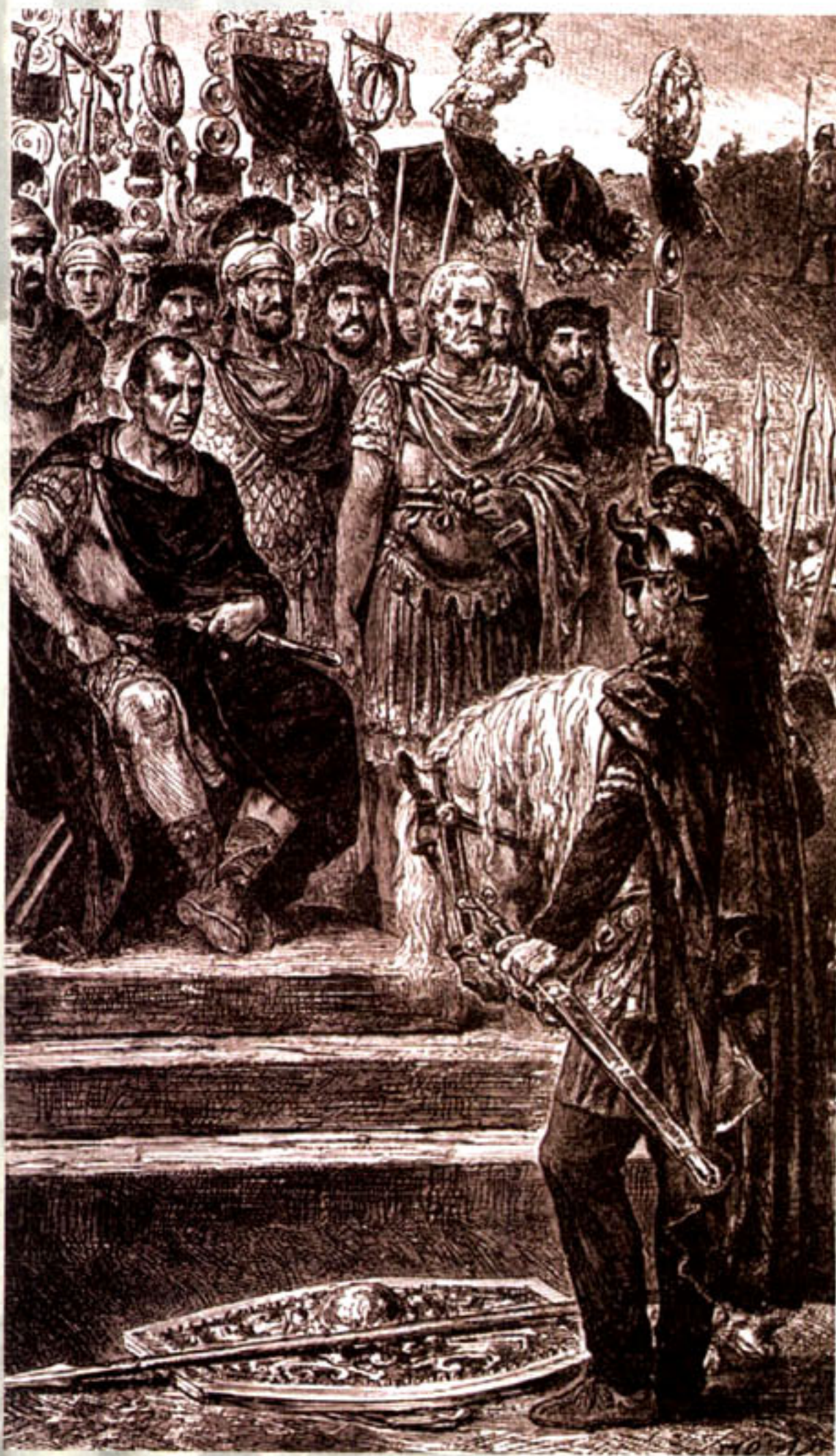
Victors and vanquished: The once-proud Gauls submit to Caesar and the Roman yoke.

The Senate ordered Caesar to disband his army. He chose instead, to the everlasting regret of history, to risk all for the sake of his ambition and cast aside forever the brittle husk of the old republic. On January 10, 49 B.C., Caesar led his army across the Rubicon River and marched on Rome.