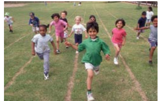
Racing to Win 10

As you learned in module two, society reproduces itself. We see evidence of this in the school system. Tracking, for example, teaches children motivation for success. If they do well, they are placed in a group that has better access to school resources. If they do not do well, they are put in groups with less access and lower outcomes. Education also, therefore, reproduces inequality. Black and Hispanic children are more likely to be placed in remedial classes while whites and Asians are more likely to be placed in advanced classes.