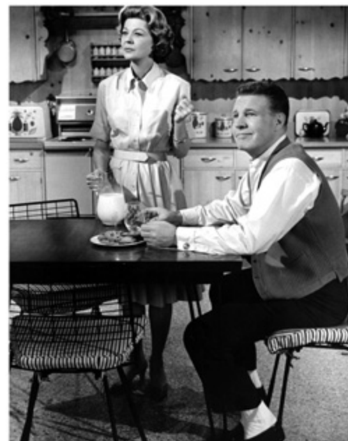
The Function of Gender Inequality 2

Sexuality [Video, 4:11 mins] is another term that is often used interchangeably with sex and gender although it has a unique