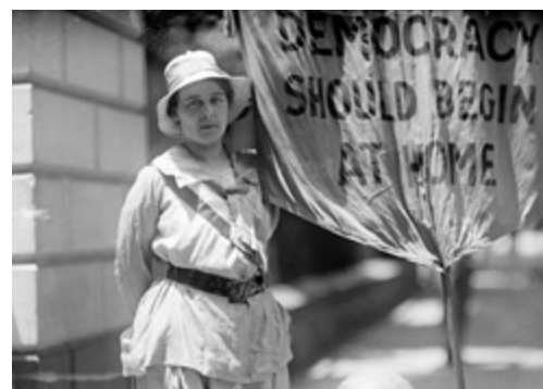
Democracy should begin at home. 6

Functionalists usually argue that everything that is a universal is good for social order. Gender roles are a social universal. In other words, every society has roles that are associated with masculine and feminine, though what is masculine in one culture may be feminine in another. Talcott Parsons argued that women are more suited for the expressive or nurturing role while men are better suited for the instrumental or task oriented role. This argument is primarily based on the biological relationship between having children and being female. Young children need to be nurtured so it makes sense