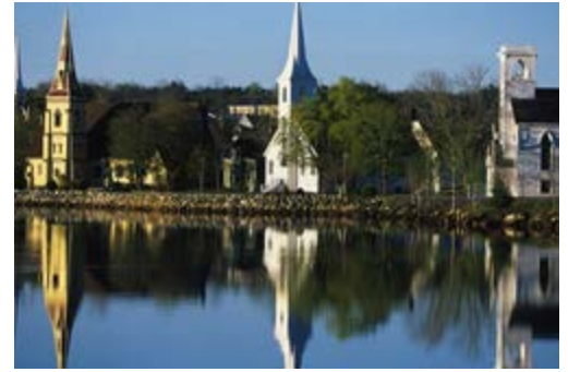
Multiple Churches in Nova Scotia 11

residents claim a religious affiliation. Of those, the majority are Christian though they don't all belong to the same denomination (e.g. Protestants, Catholics, Mormons, etc.). Religion can be extrinsic (public displays of commitment such as service attendance) and intrinsic (a personal relationship to the divine). Fundamentalists are often associated with acts of hate and/or terrorism however the exact meaning of this term is one that interprets religious scriptures literally. Evangelicals are those that work to convert non-believers to their faith. Structural functionalists argue that religion shapes everyday moral behavior and gives meaning to life. Conflict theorists argue that religion promotes inequality and conflict. Symbolic interactionists argue that we must understand religion from the meaning that it gives individuals. The US is a secular nation. It has a separation of church and state. The state cannot dictate religious practices and religion doesn't control legal action. Despite this, every elected president has been a member of a Christian denomination and religion is often a discussion during the election. For example, many argued that if John F. Kennedy was elected, the Pope would run the US government.