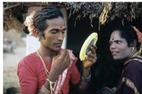
Hijras of India 1

In module 4, you learned about inequality as it applied to race and social class. Gender and sexuality are also statuses that are used to determine how you will be stratified in society. Most societies are male dominant and most societies provide preferential treatment to heterosexuals. In this module you will learn theories that discuss how much of sexuality and gender is biologically determined and how much is socially determined. You will also begin to learn about social institutions and how they meet the needs of a society. You will learn about theories that explain why institutions work the way they do and how this can both harm and benefit a social structure.