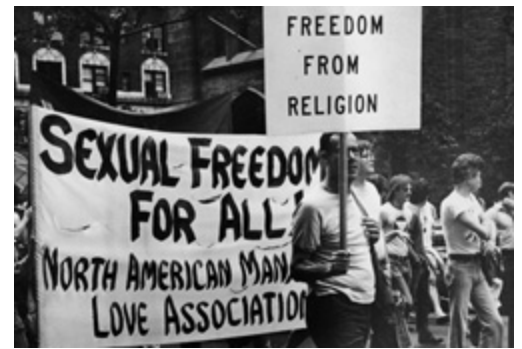
New York Gay Pride Parade 3

meaning. Sexuality refers to the orientation that an individual has toward sexual desire and behavior. Heterosexuals are attracted exclusively to the opposite sex. Homosexuals are attracted exclusively to the same sex. Bisexuals are attracted to both sexes and Asexuals are attracted to neither sex. This list has grown since the assigned textbook was published, which illustrates the fluidity of social understanding around sexuality. The newest identification is Demisexual. This refers to a group of people that are asexual in the absence of intense emotional commitment. Demisexuals can be hetero-, homo- or bi-sexual. Sexuality has become less binary [Video, 18:11 mins] in its definition. In fact, Queer theory argues that any classification of sexuality is limiting and outmoded.