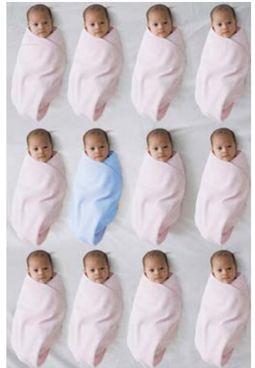
Which one is a boy? 4

While Essentialists argue that gender is biologically motivated, most sociologists are constructionists. Therefore, they argue that gender is learned through the socialization process. This takes place primarily within the family, the school, with peers and from the media. The process is known as social learning [Video, 1:37 mins]. Imagine that you are walking across campus and see friends with their new baby. You peek into the stroller and see a baby dressed in blue. You are likely to say “oh what a handsome little boy”. If the baby is dressed in pink, you will comment on the pretty little girl. If the baby is dressed in green, you might ask the parents “What did you name the baby?” The name John tells you the baby is a boy while Jill tells you it is a girl. These are just two examples of how families socialize the baby to know gender norms from the moment the baby is born. The school continues this process as boys and girls are treated differently by teachers and by the institution.