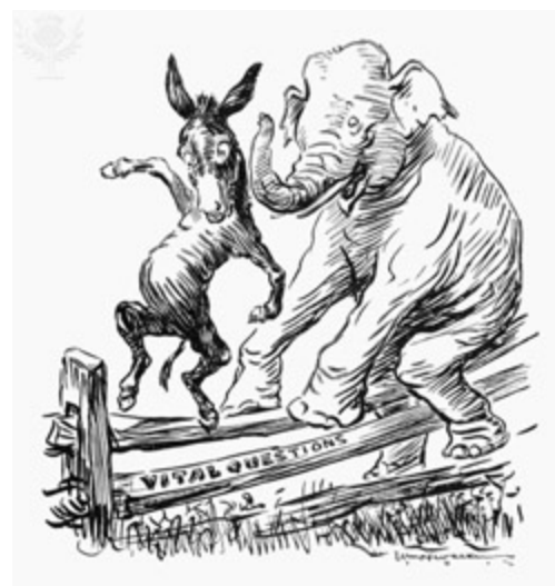
Donkey and Elephant Straddling a Fence. 7

Politics [Video, 3:18 mins] is one of the major social institutions. A social institution is a system that shapes the way groups and individuals interact. Politics refers to the institutions that shape the governing structures of a society, allocating its resources and rights among societal actors and individuals. A standard definition of politics [PDF, File Size 2.4 MB] is: the process of resolving conflicts and making distribution decisions about how scarce resources will be allocated. This neutral definition allows for all manner of processes and distributional outcomes, including extreme inequality and use of force. Any government necessarily includes a system of power and authority, which defines and enforces rights and resources allocations. Power refers to the ability to impose one’s will on another, and authority is the legitimate right to wield power. Authority can be elected, appointed or taken. While the United States is a democracy [Video, 1:49 mins] that has an elected representative governance structure, accountable to the people, other forms of government don’t require or even want democracy. An authoritarian government exists when a small number of elites hold all of the political power, and