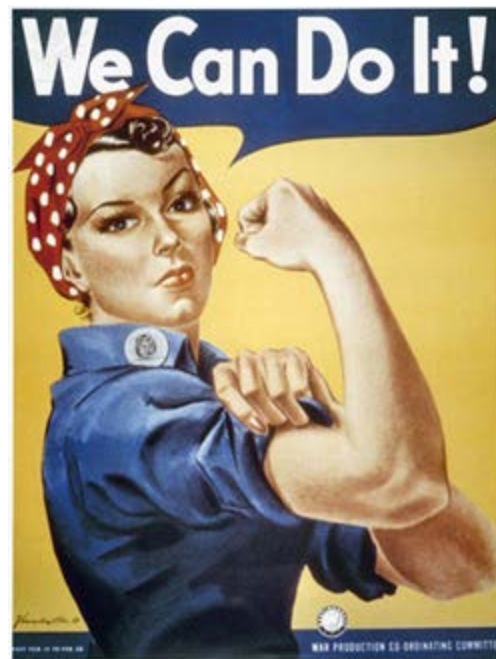
Rosie the Riveter 5

You began learning about inequality in Module 4. To fully understand inequality [Video, 2:08 mins], you must also consider the roles that gender and sexuality play in social stratification. Most societies are patriarchal. Think about your last name. Are you named for your father's family or your mother's family? Most of us take the last name of our father. When women marry, there is still a strong expectation that they will assume the last name of their husband. These are signs of social patriarchy; the male domination of society and culture. Patriarchal societies typically have sexism [Video, 1:38 mins] built into the values and the institutions. Sexism is discrimination based on sex that is based on the belief that one sex, typically male, has more value than the other. This creates unequal access to power and opportunities for women. Societies are also heterosexist. This means that values and beliefs consider one sexual orientation, heterosexuality, to be superior to others. This can create a climate of homophobia and/or transphobia (irrational hatred for and fear of the LGBTQ community). This level of discrimination can lead to members of the LGBTQ community remaining "closeted" or hiding their true identities from the dominant culture.