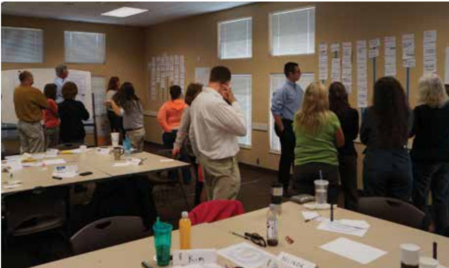
One of the 480 storyboard sessions held with Ottawa County employees.