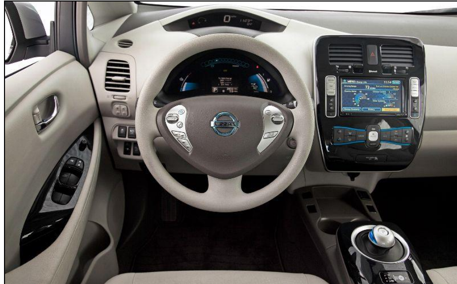
Exhibit 10 Dashboard of Nissan Leaf and of Tesla Model S