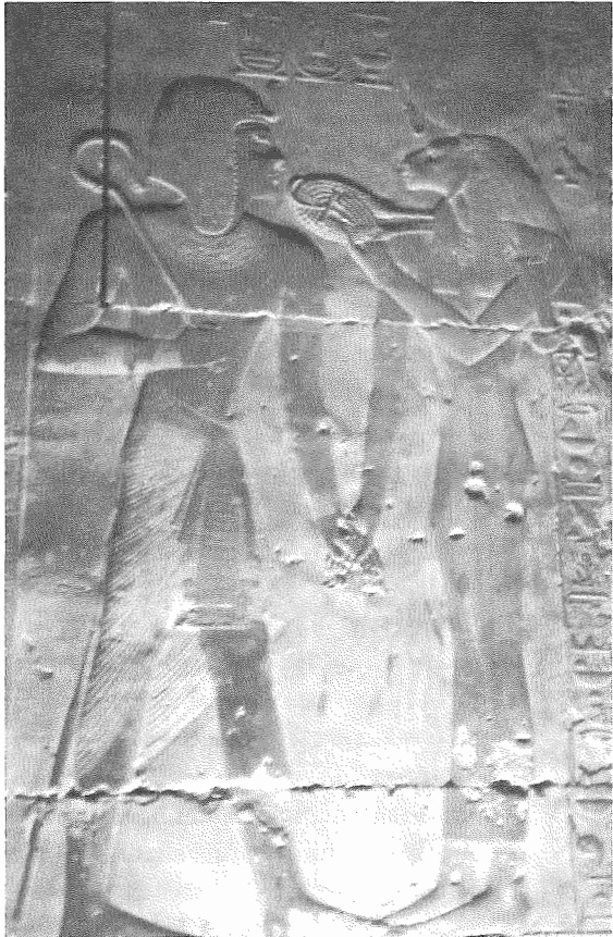
Figure 28. A king is given power over foreign lands by Sekhmet, one of the goddesses who could be known as the Eye of Ra. Relief in the temple of Seti I at Abydos.

Important goddesses such as Hathor, Bastet, and Mut can be called both the Eye of Atum and the Eye of Ra. Other Egyptian texts refer to these two eyes as if they were separate entities. This may be to distinguish between the creative and destructive aspect of the Eye goddess. The pupil of the Eye could be thought of as a womb in which gods and other beings were formed. A child or a dwarf can be shown inside the Eye, representing the sun that will be born in the red sky of dawn.