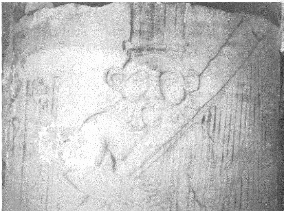
Figure 14. A dwarf god celebrating the return of the Distant Goddess. A relief in a temple which originally stood on the island of Philae.

Other texts name Shu as the one who goes to persuade his sister-consort Tefnut to return. A reference to Shu in Coffin Texts spell 75 as having “pacified her who is in the middle of her rage” may allude to this mythical role. Thoth sometimes accompanies Shu or undertakes the mission on his own. 21 As “the heart and tongue” of the gods, Thoth uses wise words to appease the dangerous goddess.