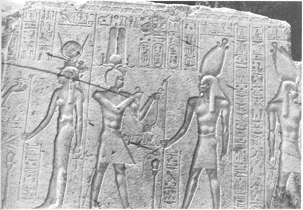
Figure 15. A ruler of the fourth century BCE worships Osiris Wenenefer (center), shown as an idealized king of Egypt. Relief in the temple of Behbeit el-Hagar.

wife. That Geb's claim to the throne is disputed is clear from an episode in which he tries to put on his father's headdress and is burned by its serpent guardian. Eventually, Geb is accepted as ruler and has to rally his forces to defend Egypt against the "children of Apophis."